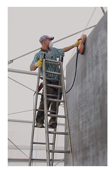
Polishing fair-faced concrete for Holocaust monument