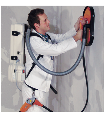
Working with the Rucksack Vacuum Cleaner