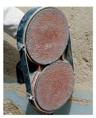
Removing old plasters